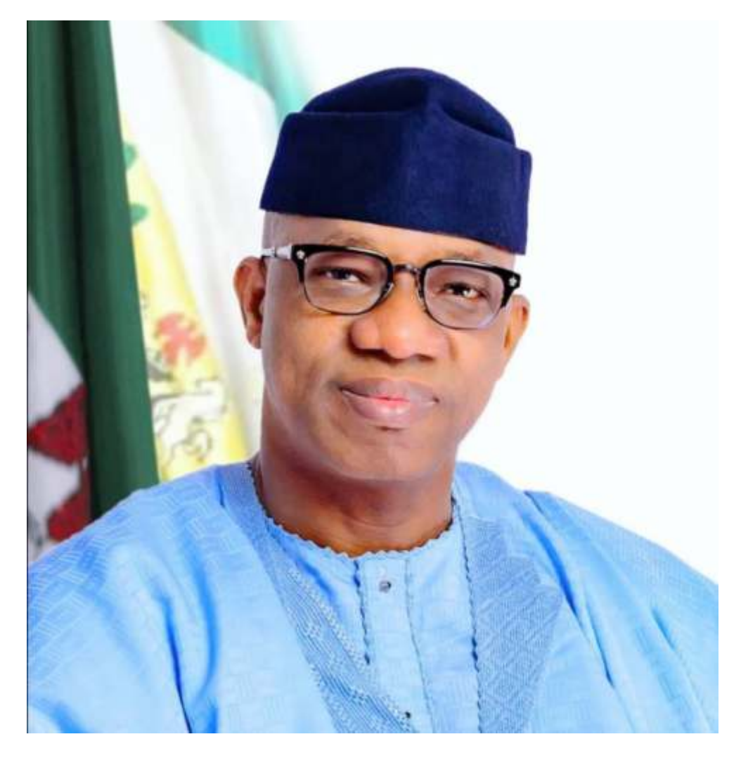
His Excellency Prince Dapo Abiodun MFR Governor, Ogun State of Nigeria