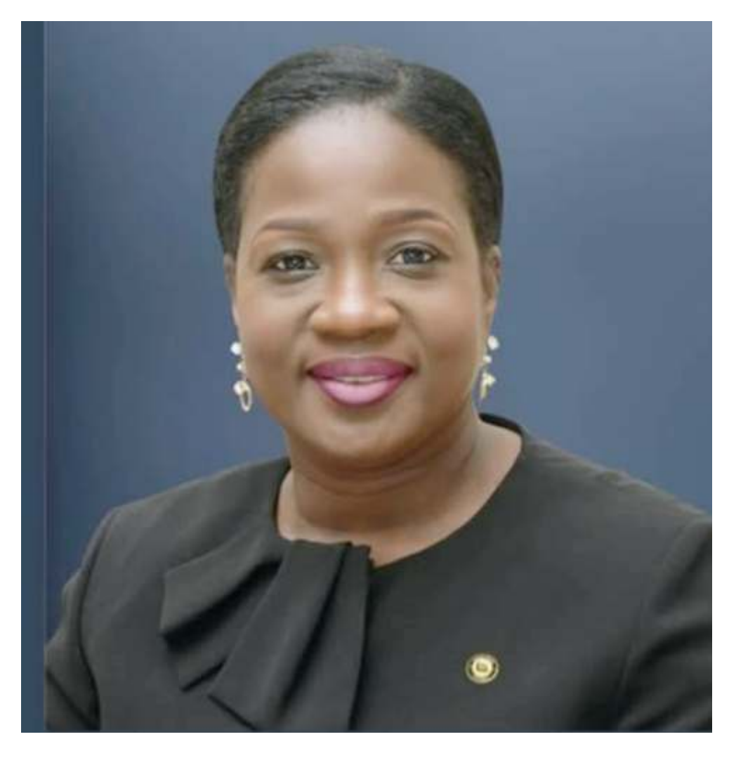
Dr. Tomi Coker Honourable Commissioner for Health Ogun State Government